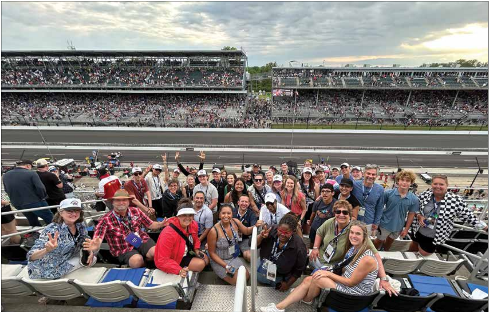
Indianapolis welcomed hundreds of thousands to the city over Memorial Day Weekend, with 345,000 race fans attending the 108th running of the Indianapolis 500, plus two Eastern Conference NBA games. To celebrate, Visit Indy hosted 60+ meeting planners and guests for a familiarization trip around the city, which ended with the group experiencing the Indy 500 in a suite overlooking the start and finish line.