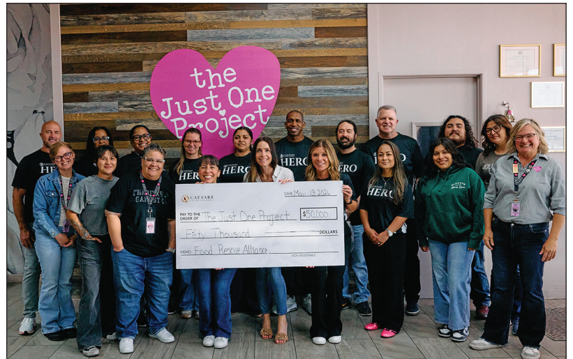
Caesars Entertainment donated $50,000 to The Just One Project.