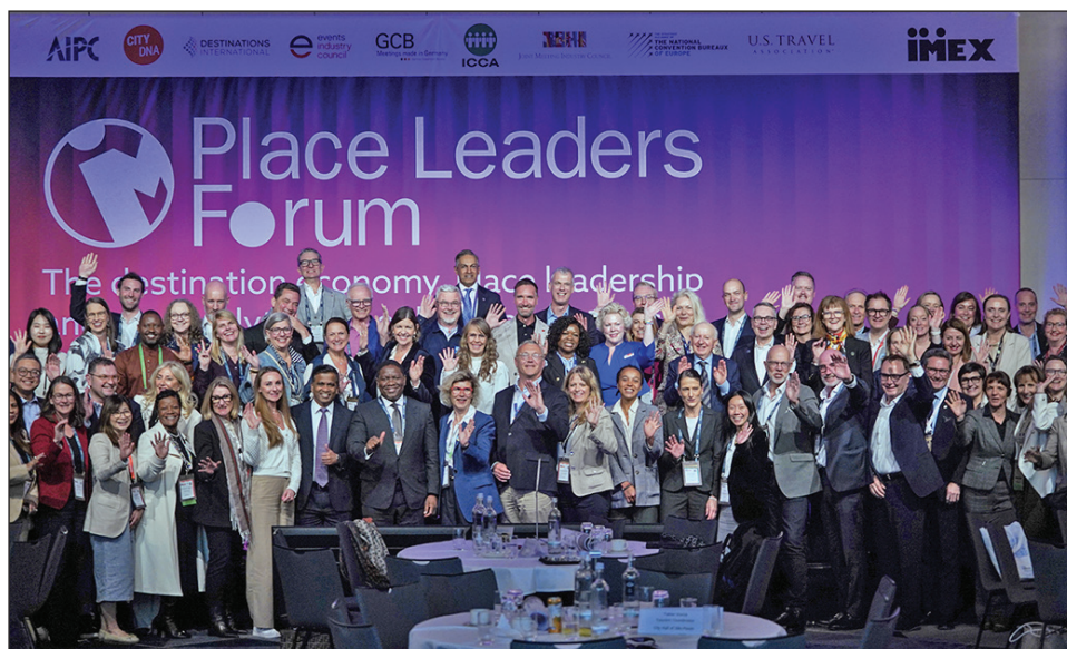
On May 19, the IMEX Place Leaders Forum was held at the Marriott Frankfurt Hotel.

IMEX America will be held October 13–15 in Las Vegas.