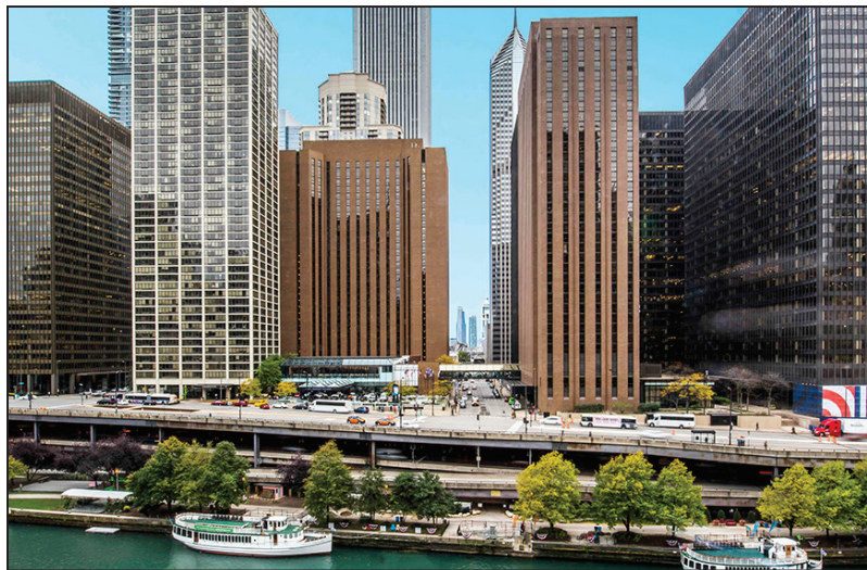
The Hyatt Regency Chicago completed its multi-phase, $200 million renovation last month.

Prior to the third and final phase of the property-wide renovation, the Hyatt Regency completed the transformation of its West Tower