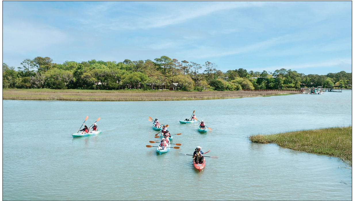
Padding the winding waterways of Kiawah Island

The secluded barrier island is framed by a unique mix of coastal environments, each with its own personality, giving rise to an endless array