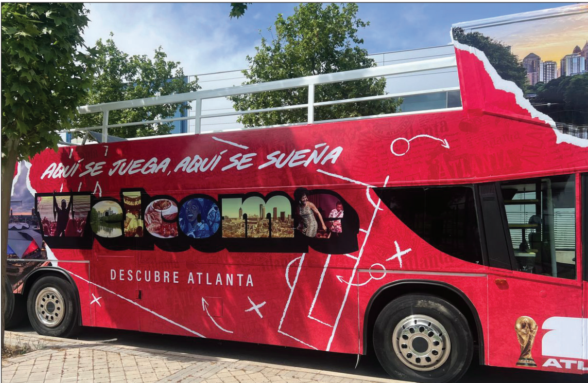
With the Atlanta CVB (ACVB) busy promoting the destination as a host city for FIFA World Cup 2026, a themed bus traveled through iconic locations in Madrid late last month to engage local audiences and build momentum ahead of the tournament. Atlanta's Mercedes-Benz Stadium will host eight World Cup matches from June 15 through July 15.