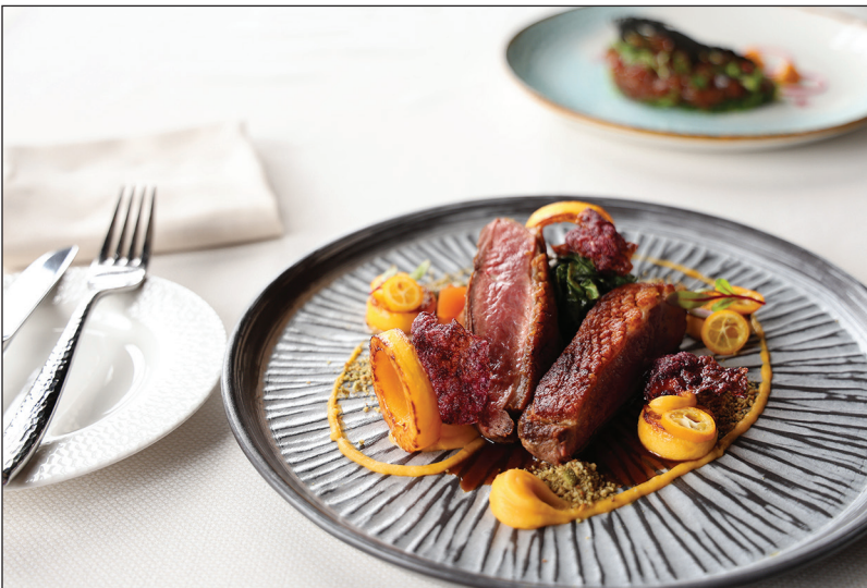
Forbes Five-Star dining at The Ocean Room

The resort is easily accessed by car or Charleston International Airport (CHS), followed by a leisurely drive. For workdays-turned-weekend getaways, nothing comes close to Kiawah Island Golf Resort —50 years and counting.