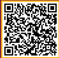
SCAN TO LEARN MORE

Montgomery County, Maryland brings people together through meetings and events where inclusion, culture, and community are woven into everyday life. From farm breweries and wineries to globally inspired cuisine, upscale meeting space, and walkable town centers, it's easy to turn an agenda into an experience. Let us help you plan your next gathering in Maryland's Cultural Capital — just minutes from Washington, D.C.