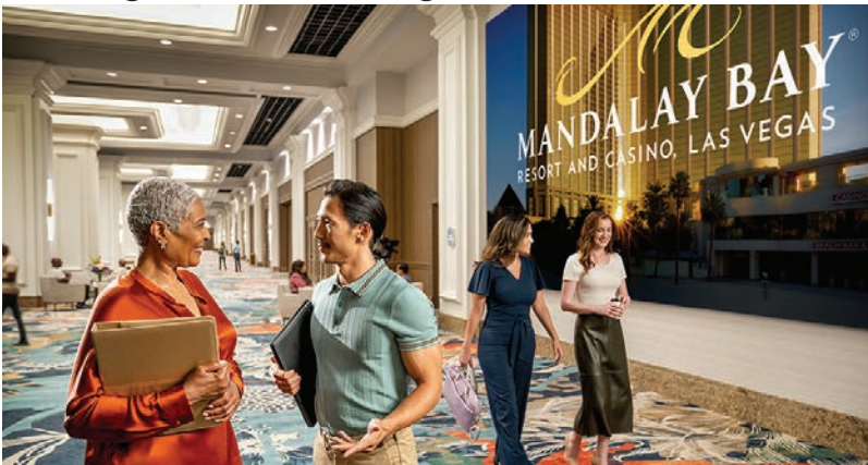
Mandalay Bay Convention Center Redesign

At MGM Resorts, meetings and events are at the heart of what we do and we are constantly investing in our resorts and meeting infrastructure so our clients are never experiencing the same Las Vegas twice. From large-scale renovations like the Mandalay Bay Convention Center redesign to enhancements across our guest rooms, dining, and entertainment offerings, we are continually reimagining what a modern meeting experience can be. Our goal is simple: create environments where ideas thrive and attendees feel inspired every time they visit.