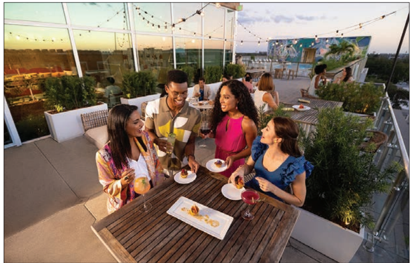
Head to Sal Y Mar, the rooftop bar and events venue atop the dual-branded Aloft and Element hotel in Midtown Tampa, offering skyline views and an elevated setting for group dinners, receptions and casual business gatherings.

event or room block reserved in 2026 comes with complimentary carbon offsets. Explore the latest savings opportunities to find the right option for your event.