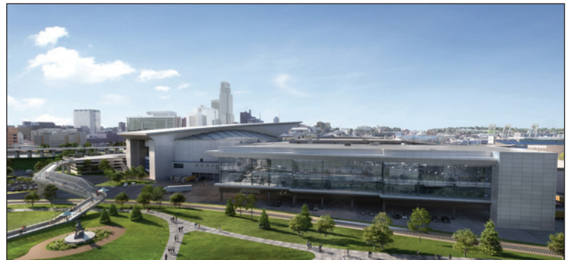
CHI Health Center Omaha (rendering)

a complicated itinerary. And the new free-to-ride streetcar, coming in 2028, will loop from midtown to downtown, connecting convention hotels, entertainment districts and key attractions.