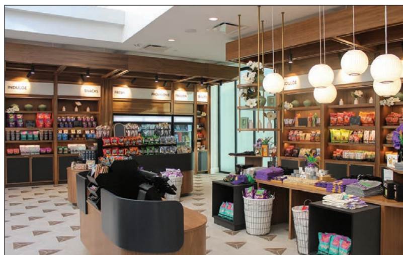
Junction Café & Provisions opened its first location at the Hilton New Orleans Riverside in February.

the dialogs with the bartender. They want to understand what's really exciting and new. They want to meet the chefs, to see this beautiful food. But they're also want that comfortability, that 'I'm making a decision that I'm not going to regret.'"