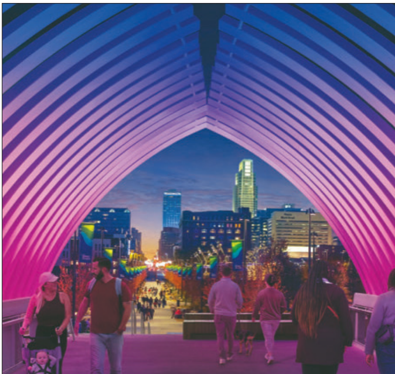
Heartland of America Park at The RiverFront

Stop by the Visit Omaha booth #700. Get fitted. Pick up your gift. Drop off a donation. Then picture your next meeting in Omaha.