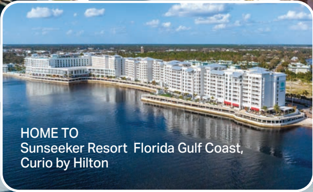
HOME TO Sunseeker Resort Florida Gulf Coast, Curio by Hilton

Host your next meeting or retreat where Southwest Florida beauty meets cutting-edge facilities. Enjoy 44,000 square feet of waterfront meeting spaces at the Charlotte Harbor Event & Conference Center or 60,000 square feet of luxury spaces at the Sunseeker Resort Florida Gulf Coast. Beyond the boardroom, discover biking trails, Blueway paddling, and waterfront dining. Seamless planning ensures every detail inspires success.