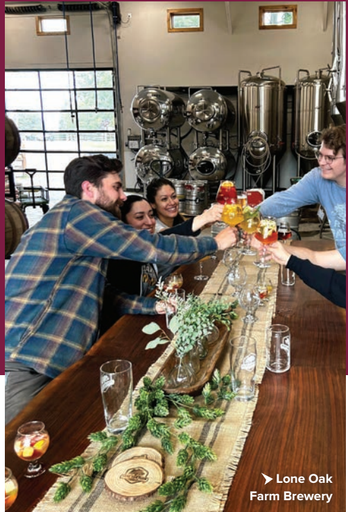
► Lone Oak Farm Brewery