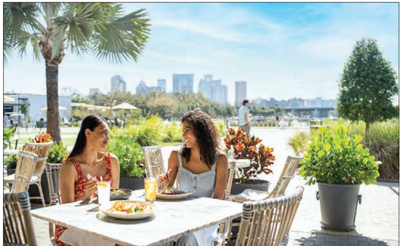
Experience Armature Works, where The Heights Market offers a lively setting for team dinners and gatherings, with standout options including MICHELIN-recognized Oak & Ola.