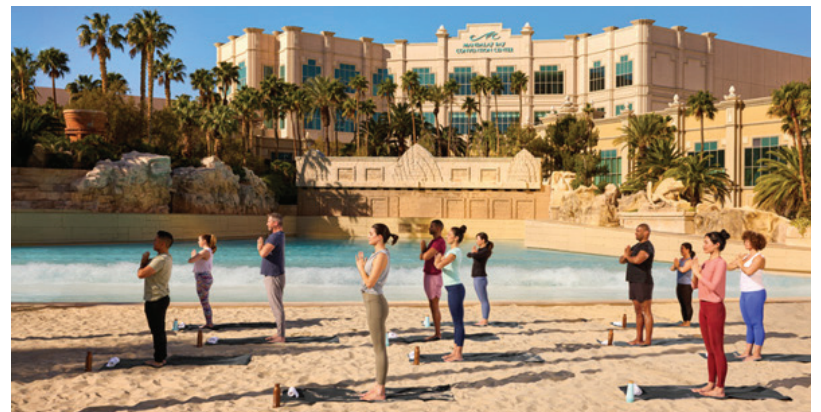
Yoga on the Mandalay Bay Beach

Meetings should do more than bring people together – they should leave a lasting impact. At MGM Resorts, we are Focused on What Matters , with a focus on fostering a culture of respect, supporting our communities and investing in environmental stewardship. We also recognize the importance of wellness as part of the meeting experience, so attendees arrive inspired and leave feeling refreshed.