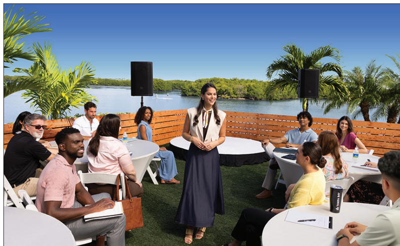
Host outdoor meetings at DoubleTree by Hilton Tampa Rocky Point Waterfront hotel where bay views and open-air space create a clear, focused setting that balances work with a relaxed atmosphere.