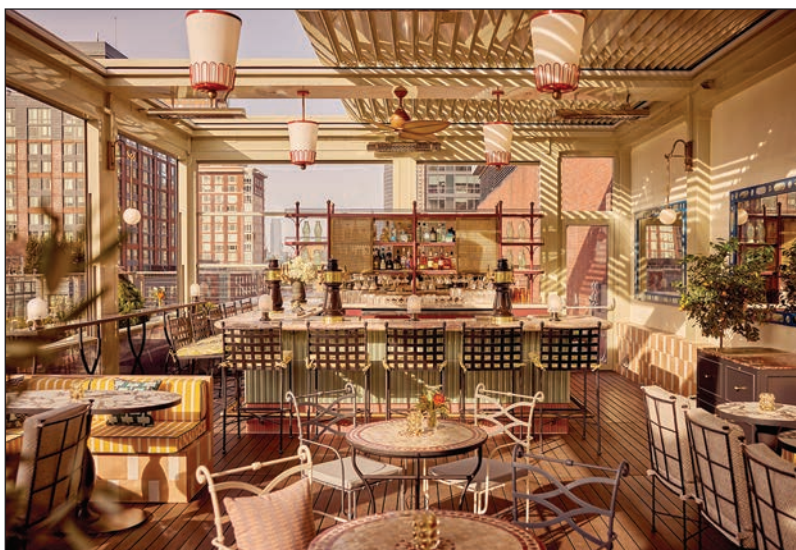
The interior of the Leonessa at the Conrad New York City

One such concept includes Junction Café & Provisions, which debuted at the Hilton New Orleans Riverside earlier this year. The concept blends offering reliable market staples and brands while also providing locally made merchandise as well as grab-and-go market items made with ingredients often used in local cuisine to create a high-end market where guests can connect with their host city. More locations are set to debut later this year, according to Hilton representatives.