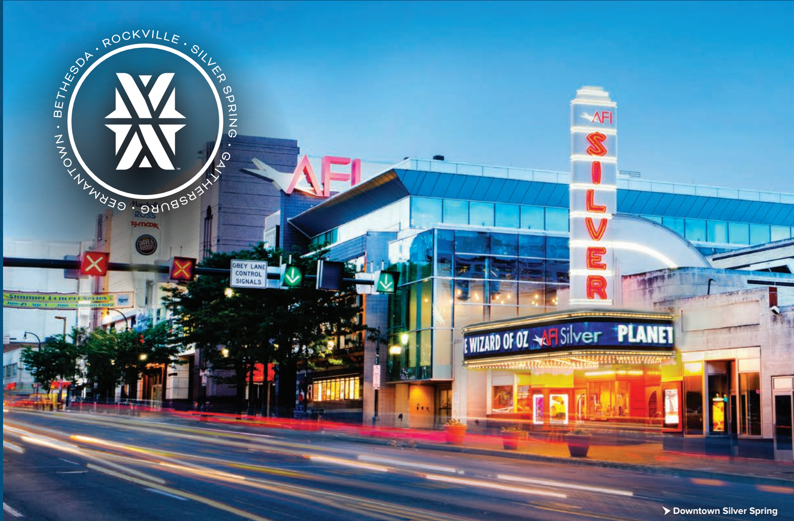
► Downtown Silver Spring