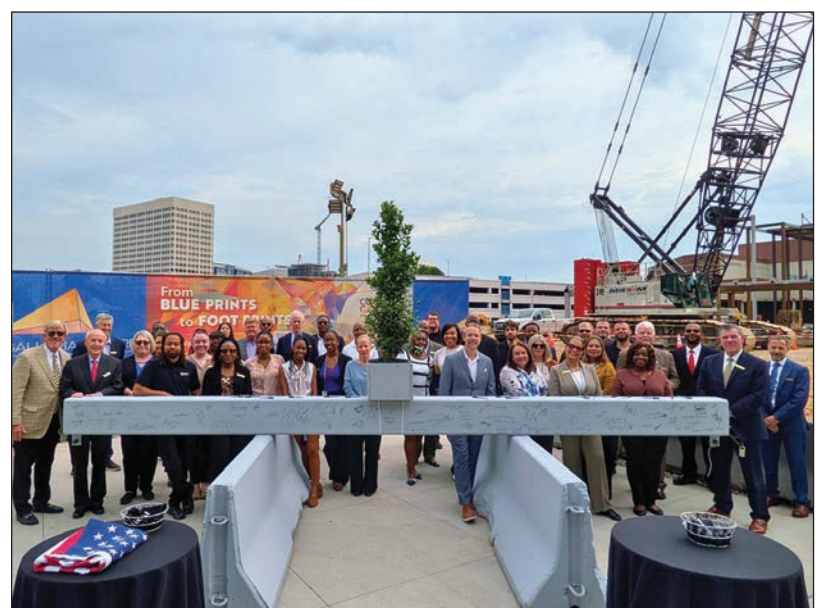
The Cobb Convention Center Atlanta in late May celebrated the placement of the final steel beam in its $190 million expansion and renovation project. The construction tradition of "Topping Out" saw members of the Cobb-Marietta Coliseum & Exhibit Hall Authority, the staff, and the construction team sign the final steel beam, which was also adorned by an American flag and a tree. The tradition of placing a tree atop a structure has its origins in Scandinavian culture, dating back over a thousand years.

"The partnership is expected to serve as a national model for how municipal leadership, destination organizations, and industry stakeholders can work collaboratively to drive inclusive economic growth through the meetings, tourism, and hospitality sectors," the organizations said.