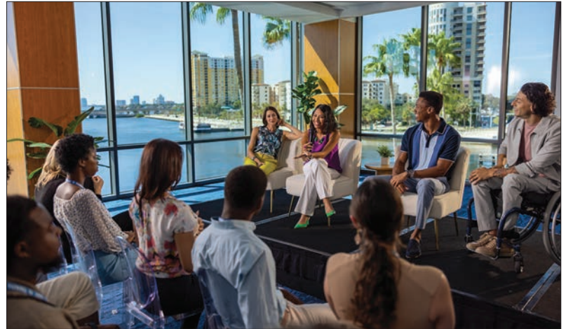
Discover the Tampa Convention Center, where stunning waterfront views along the vibrant Tampa Riverwalk create a memorable backdrop for meetings, events and gatherings of all sizes.

In addition to savings and flexibility, Partner Match+ provides extra benefits. For example, at the Renaissance Tampa International Plaza Hotel, any