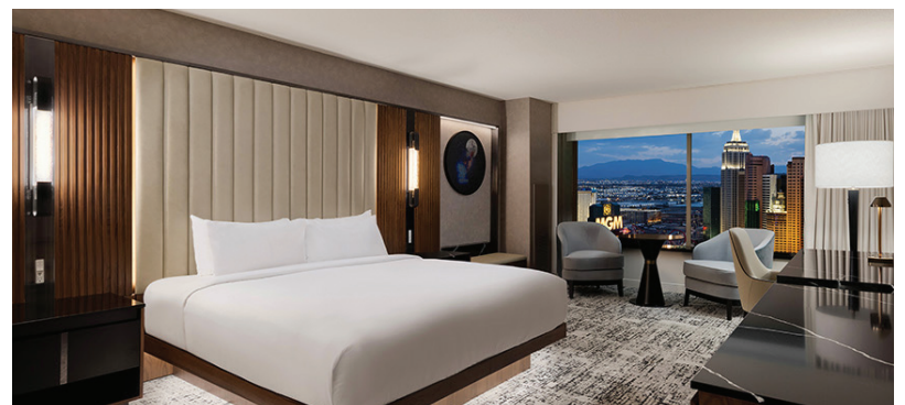
MGM King remodeled room at MGM Grand

One of the biggest advantages of hosting meetings with MGM Resorts is that no two visits are ever the same.