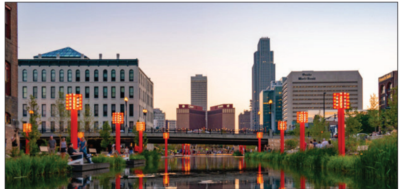
Gene Leahy Mall at The RiverFront

Getting here is simple. Omaha's airport is less than five minutes from the convention district — no long transfers, no rental cars, no logistical headaches between the gate and the meeting room. Omaha sits near the geographic center of the country, putting most major U.S. cities within a two-hour flight and making it an easy drive from throughout the region. That access pays off in attendance numbers. Once your group arrives, more than 3,600 hotel rooms are within a mile of CHI Health Center Omaha, and a skywalk connects the convention center directly to the 600-room Hilton Omaha. The district is walkable and safe. Omaha's historic Old Market Entertainment District has cobblestone streets, chef-led restaurants, patio bars and independent shops and is a short walk from the convention center. Attendees can enjoy the destination without a car or