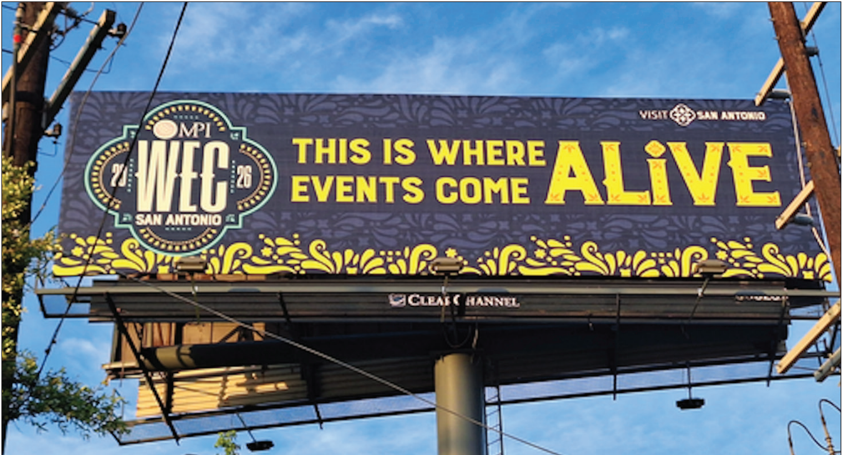
To welcome attendees to Alamo City for the WEC, Visit San Antonio and MPI placed a billboard on the highway leading from the airport to downtown. The WEC is being held from June 2 –4.