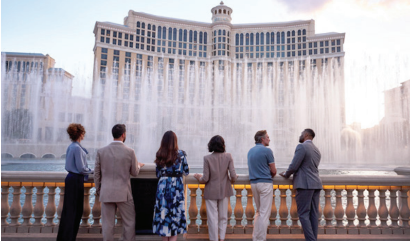
MGM Resorts and Bellagio Las Vegas

In a world driven by digital technology, one thing remains clear: when people come together, business moves forward. At MGM Resorts , we've long believed in the power of face-to-face meetings to drive your business.